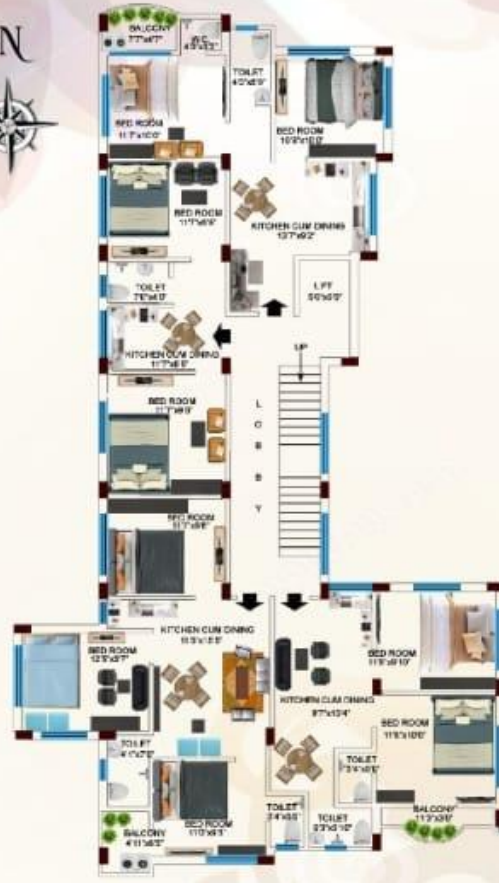
TYPICAL FLOOR & FURNITURE LAYOUT PLAN ( 4TH FLOOR )