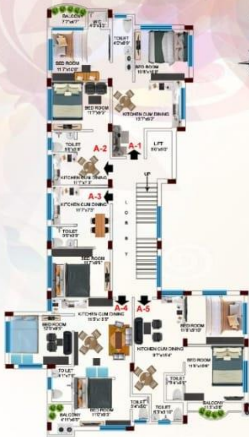
TYPICAL FLOOR & FURNITURE LAYOUT PLAN ( 1ST, 2ND, 3RD & 5TH FLOOR )